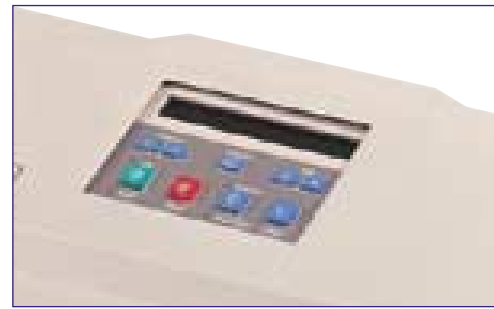
Easy Operation - Centralised Control Panel

The U561 is a completely automatic mail processing system, which feeds, seals, franks and stacks mail in one operation. It's ideal for mid to high volume applications, especially when dealing with different types and sizes of mail.