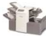
SPECTRUM 3 Series™