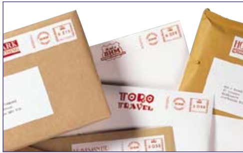
Quick and Easy Parcel Processing