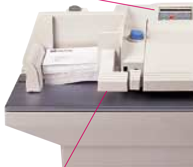
Extendible side guide