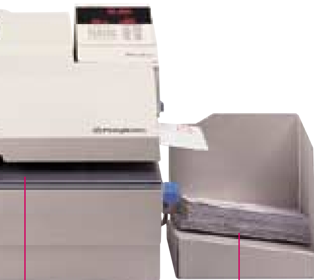
Automatic sealing mechanism