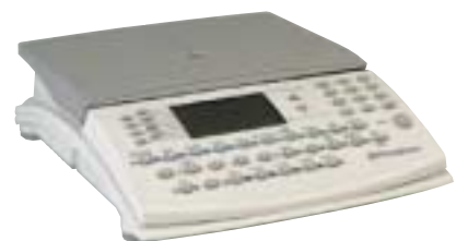
12kg postal scale